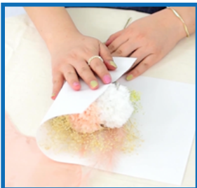
1. Loosely cover your floral arrangement with paper