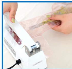
3. Once your arrangement is in place, remove the paper and heat seal the large neck