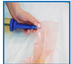
4. Cut to top of the small neck off and inflate to your desired size. Remove the outer film as the balloon inflates