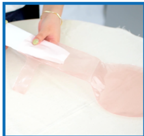
2. Insert your floral arrangement to the Aqua via the large neck