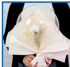
7. Wrap out your design ready for your customers