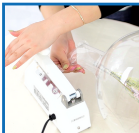
5. Heat seal the small neck